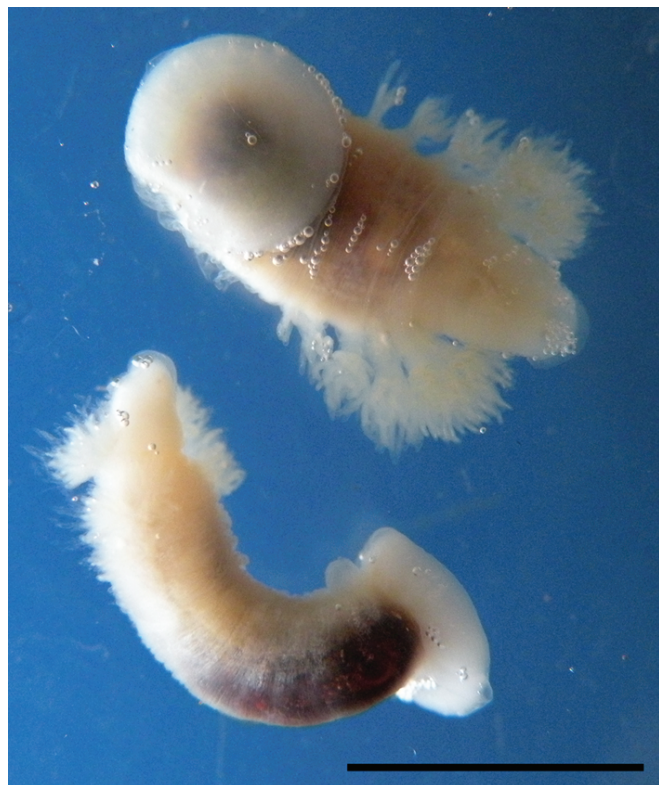
Figure 2. Two specimens of Ozobranchus margoï that were found attached to the loggerhead turtle. Bar 1 cm.

of juveniles and eggs, predatory fishing and water pollution contribute towards this risk. In order to avoid decreases in turtle populations, conservation programs are currently in progress in Brazil (MARCOVALDI; MARCOVALDI, 1999). It is important to note that, as a further important conservation procedure, the diseases that affect sea turtles should be identified. Occurrences of parasitic and infectious diseases can impair animal health and also cause death, thus reducing sea turtle numbers. In this regard, Ozobranchus spp. represents a health hazard to sea turtles, since it can cause direct damage and also be a vector for infectious agents.