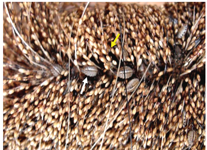
Figure 2. Haematopinus quadripertusus : Nits (yellow arrow) and adults (white arrow) on the tail of a cow with intense infestation.

exhibited a sternal plate with long sharp anteromedian projections in both the male and female specimens, and the males exhibited a genital plate. The female specimens (n = 116) measured on average 4.14 \pm 0.48 mm in length, while the males (n = 17) and nymphs (n = 92) measured on average 3.44 \pm 0.39 mm and 2.45 \pm 0.65 mm, respectively.