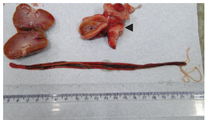
Figure 2. Right kidney (not parasitized) and supernumerary kidney (parasitized, arrow) of the female feline parasitized by a 19.5 cm long Diectophyme renale .

creatinine levels had not changed was explained by the presence of three functional kidneys, although the cortical layer of the right kidney was compromised, the supernumerary kidney was parasitized, and the left kidney showed compensatory hypertrophy.