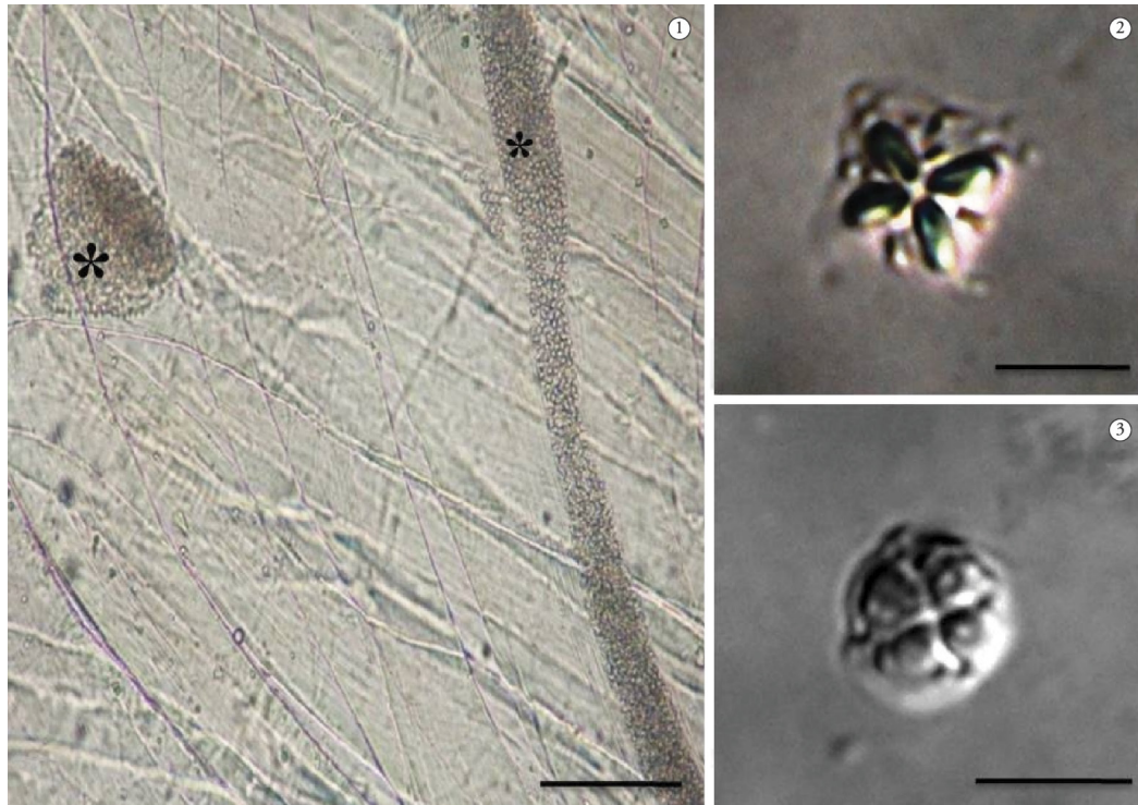
Figures 1-3. Optical micrographs: 1. Cysts of Kudoa spp. (*) in fresh muscle of P. squamosissimus Bar= 100 \mu m. Spores of Kudoa spp. in DIC: 2. stellate in format; 3. Pseudoquadrate in format. Bar = 5 \mu m.

found in somatic muscle fibers, but with no inflammatory reaction (ANDRADA et al., 2005). In Aequidens plagiozonatus , Kudoa aequidens was reported with ultrastructural data; this was first reported in Brazilian aquatic fauna in the subopercular muscles, thus emphasizing that no direct inflammatory responses were found in the fibers but, rather, free spores that had disintegrated between myofibrils, which indicated that muscle liquefaction was associated with presence of spores (CASAL et al., 2008).