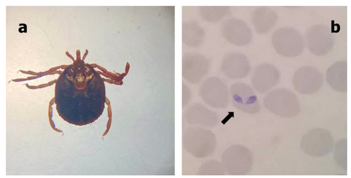
Figure 1. (a) Dorsal view of the female Amblyomma mixtum ; (b) Photomicrograph of the paired intra-erythrocytic pyriform identified on Giemsa-stained thin blood smear suggested as Babesia sp.