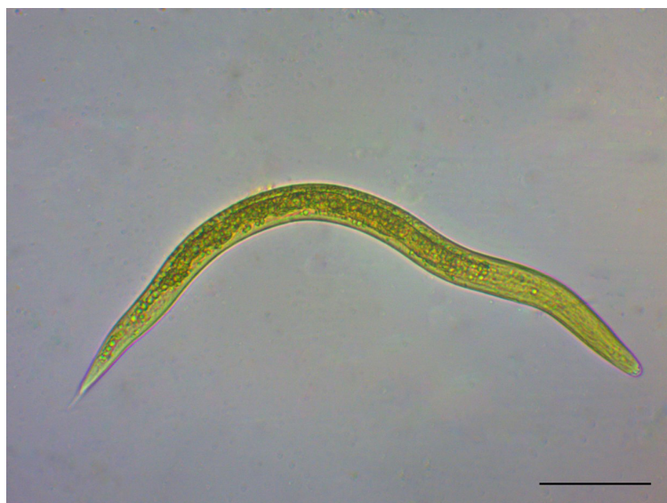
Figure 1. First-stage larva (L1) of Dictyocaulus sp. detected in feces from cattle in northeastern Brazil (scale-bar = 50 \mu\text{m} ).

This study assessed the occurrence of Dictyocaulus sp. infection in beef cattle herds reared in an important area of livestock production in the northeastern region of Brazil. Until now, occurrences of this parasite had only